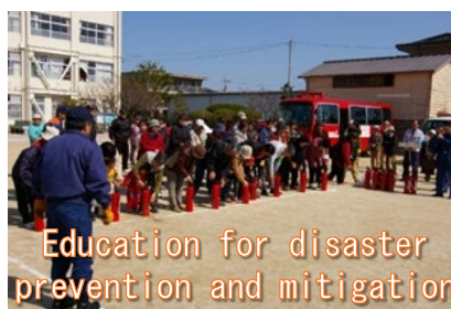
Education for disaster prevention and mitigation

To cope with natural disasters, which are occurring more frequently and intensely in recent years, the city strives to strengthen the functions of the newly established Disaster Response Headquarters by conducting training and workshops with the related departments throughout Fukuoka City. The city also holds evacuation drills and lectures related to disaster management and mitigation, which are popular among its citizens, as well as seminars on fire management of fire and disaster mitigation.