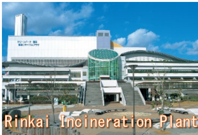
Rinkai Incineration Plant