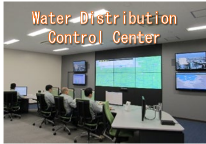
Water Distribution Control Center