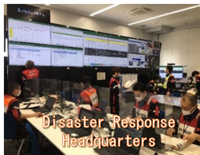
Disaster Response Headquarters