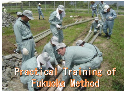
Practical Training of Fukuoka Method