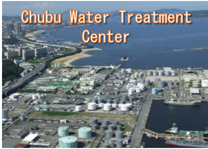
Chubu Water Treatment Center