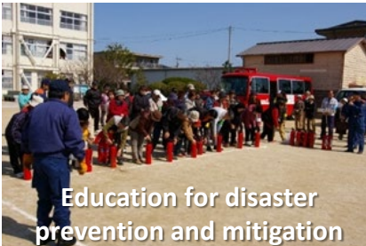
Education for disaster prevention and mitigation