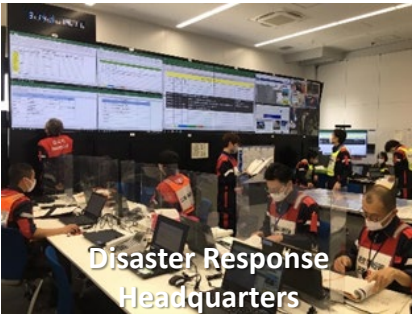
Disaster Response Headquarters