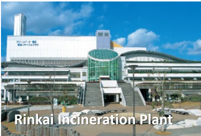
Rinkai Incineration Plant