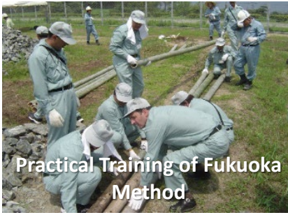
Practical Training of Fukuoka Method