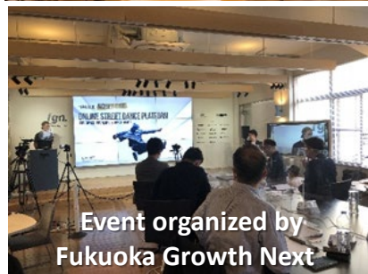
Event organized by Fukuoka Growth Next