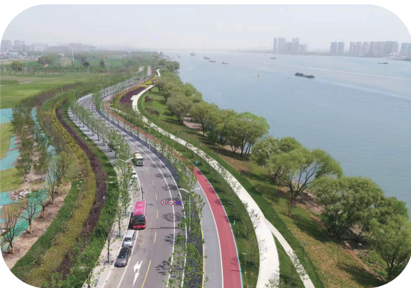
Environmental Landscape Improvement Planning for Yangtze River Waterfront in Jiangbei New District of Nanjing (Nanjing, China)