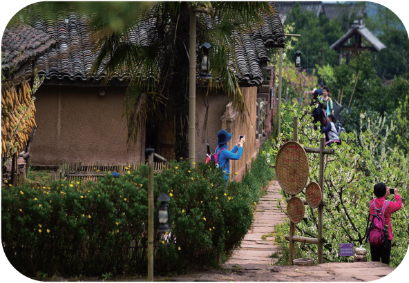
Xingfu Ridge( Ecological Homestay Settlement in Xingfu Ancient Village ) (Meishan,China)