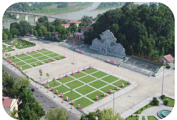
Nguyen Tat Thanh Square ~ Quintessence of the Mountains ~ (Tuyen Quang, Vietnam)