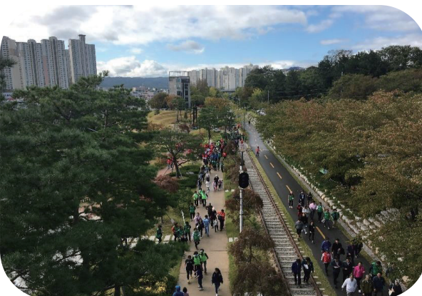
Add Roads and Forests to the Iron City (Pohang, Korea)