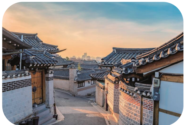
Balanced Urban Development through the Recovery of Historical and Cultural Landscape “Hanok Preservation and Promotion Policy of Seoul” (Seoul, Korea)