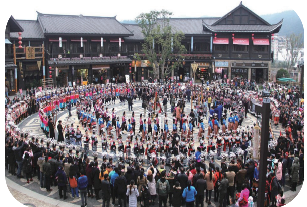
Danzhai Wanda Village (Qiandongnan Prefecture, China)