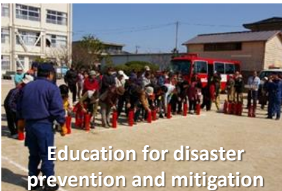
Education for disaster prevention and mitigation