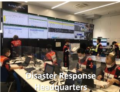
Disaster Response Headquarters