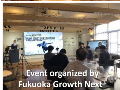
Event organized by Fukuoka Growth Next