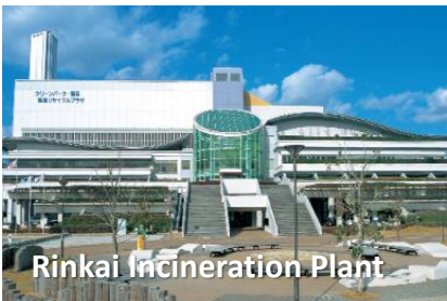
Rinkai Incineration Plant