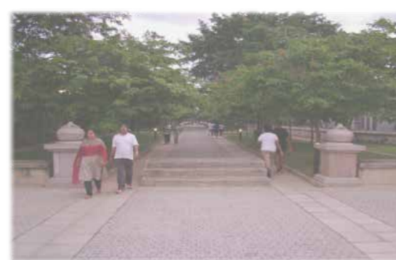
Independence Square Re-development Project (Colombo, Sri Lanka)