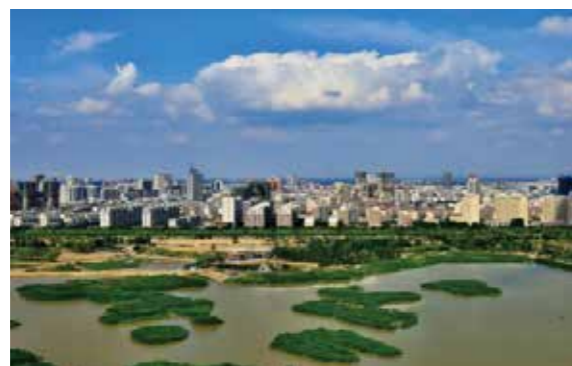
Ecological City, Livable Yinchuan (Yinchuan, China)