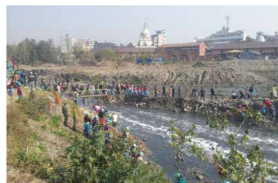
Bagmati Cleaning Campaign (Kathmandu, Nepal)