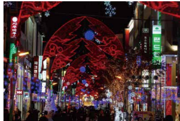
Busan Christmas Tree Festival (Busan, Korea)