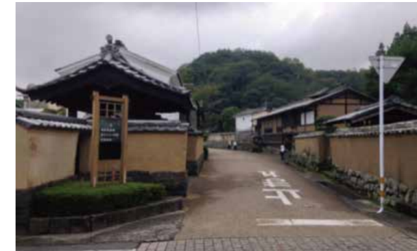
Taketa District Townscape Environmental Improvement Project : Town Planning with Historic Landscape (Taketa, Japan)