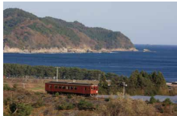
"Sanriku Railway": the Symbol of Recovery from the Great East Japan Earthquake Disaster (Iwate, Japan)