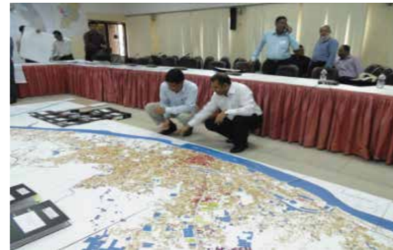
Mymensingh Strategic Development Plan (MSDP) 2011-2031 (Mymensingh, Bangladesh)