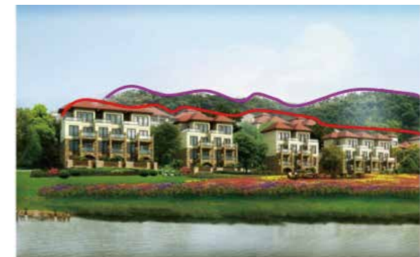
Guizhou Xibu Ecological Cultural Resort Challenge (Guizhou, China)