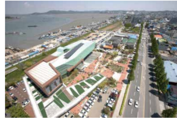
Gunsan Modern Cultural Project (Gunsan, Korea)