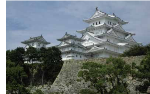
World Cultural Heritage Site "Himeji Castle" and town planning for the next generation through preservation and restoration (Himeji, Japan)