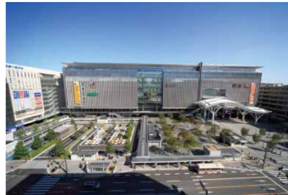
Collaborative Improvement Projects in Hakata Station Area (Fukuoka, Japan)